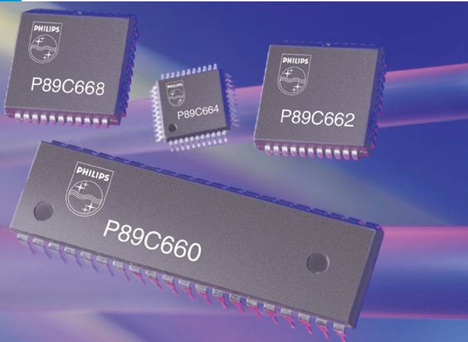
The P89C66x family is available in 44-pin PLCC and LQFP package types

The P89C66x is suitable for a wide variety of applications that benefit from low EMI and the flexibility of Flash ISP and IAP. It also supports applications that require pulse width modulation, high-speed I/O and/or up/down counting capabilities such as motor control. Because the P89C66x family has I 2 C, it is also extremely well suited for Intelligent Platform Management (IPMI) applications in servers and high-end PCs where I 2 C serves as physical protocol for the interface.