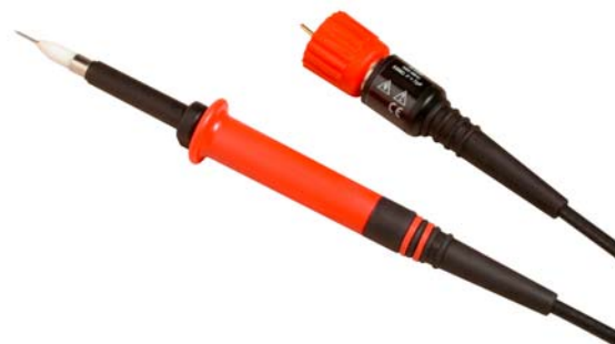
Model 6498 1000V CAT II Passive Oscilloscope Probe