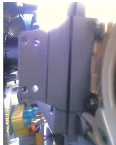
Bottom Piece Installed

INSTALLATION IS NOW COMPLETE. ENJOY YOUR NEW INDASH by PANAVISE MOUNT.