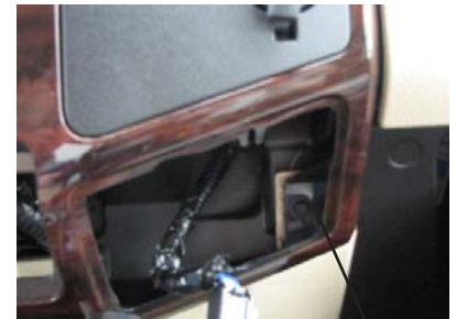
Right & Left Covers and Screws

Read instructions completely prior to starting installation. All InDash Mounts are designed so that after installation, phone is facing normal driver position for left-hand drive vehicles. This mount is not designed to be used in foreign countries with right-hand drive vehicles. Use extreme care when working around the plastic components on the dash. Excess force, can cause breakage of the plastic components.