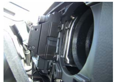
Bottom part in place