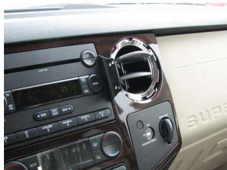
Final Installation Pictures on Ford- Super Duty