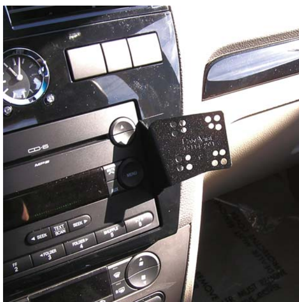
InDash installed showing location on Right Side