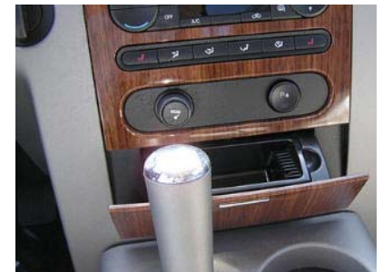
F-150 With Ashtray

STEP#2: With hook tool insert it between the bezel and dash below the lighter / power outlet, to the right or left side of the center bezel to release one clip on each side. Lift bezel out from the bottom to allow hook tool to fit in behind the bezel about the center of the sides of the radio. Pull to release (2) clips, (1) on each side. Insert hook tool into the upper part of the bezel between the bezel and upper tray. Pull on right or left side to release (2) clips, (1) on each side. Pull bezel out far enough and to the side to get at the screws that holds the right side of the radio in place. Use Clean Shop Cloth to protect surfaces as necessary.