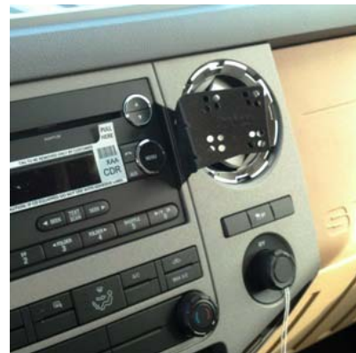
Final Installation Picture of Super Duty 2013 Without NAV

Read instructions completely prior to starting installation. All InDash Mounts are designed so that after installation, phone is facing normal driver position for left-hand drive vehicles. This mount is not designed to be used in foreign countries with right-hand drive vehicles. Use extreme care when working around the plastic components on the dash. Excess force, can cause breakage of the plastic components.