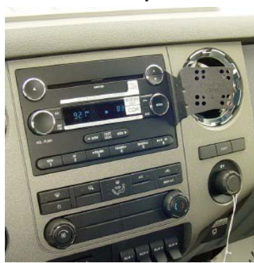
Final Installation Picture on 2011