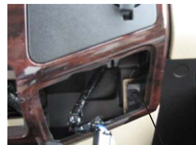
Right & Left Covers and Screws

Read instructions completely prior to starting installation. All InDash Mounts are designed so that after installation, phone is facing normal driver position for left-hand drive vehicles. This mount is not designed to be used in foreign countries with right-hand drive vehicles. Use extreme care when working around the plastic components on the dash. Excess force, can cause breakage of the plastic components.