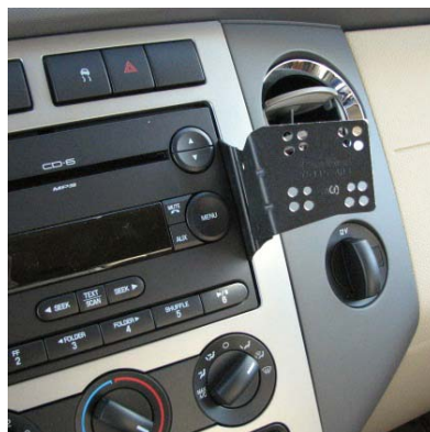
Expedition and F-150 Final Installation Picture