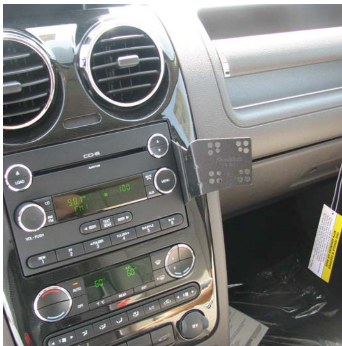
Final Installation Picture Ford TaurusX 08