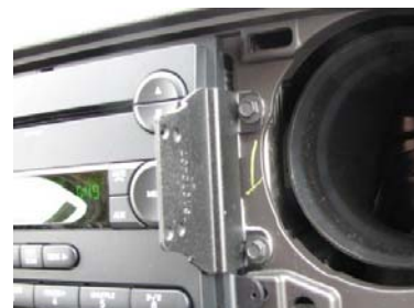
Bottom part in place