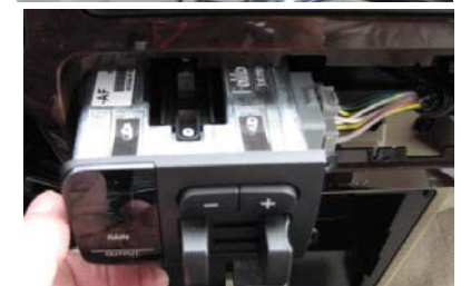
Brake Controller Slides Out