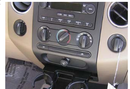
F-150 Without Console

STEP#3: With 9/32" socket driver remove the (2) screws that hold the right side of the radio in place. Place the InDash by PanaVise Mount Bottom Piece over the (2) screw holes. Reinstall the (2) screws. Install the top piece with the 75001 number on top with the (2) Acorn nuts using a 5/16" wrench.