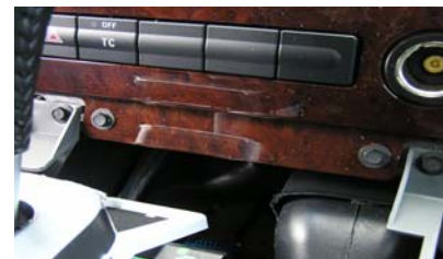
(2) screws below bezel

INSTALLATION IS NOW COMPLETE. ENJOY YOUR NEW INDASH by PANAVISE MOUNT.