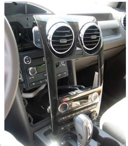
Dash Bezel Removed

INSTALLATION IS NOW COMPLETE. ENJOY YOUR NEW INDASH by PANAVISE MOUNT.