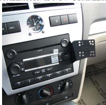
Final Installation Picture on 500 and Montego