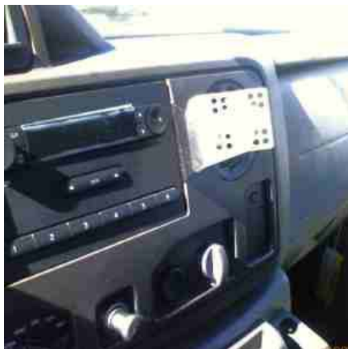
Finished Install Picture