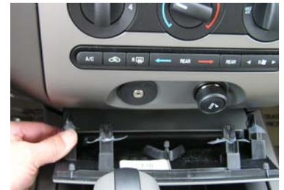
Expedition Cover Removal

Read instructions completely prior to starting installation. All InDash Mounts are designed so that after installation, phone is facing normal driver position for left-hand drive vehicles. This mount is not designed to be used in foreign countries with right-hand drive vehicles. Use extreme care when working around the plastic components on the dash. Excess force, can cause breakage of the plastic components.