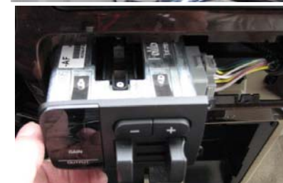
Brake Controller Slides Out