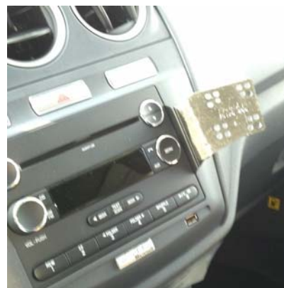
Final Installation Picture of Transit Connect 2013