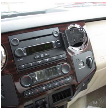
Final Installation Picture on 08-10

INSTALLATION IS NOW COMPLETE. ENJOY YOUR NEW INDASH by PANAVISE MOUNT.