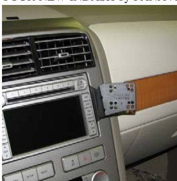
MKX Final Installation Picture