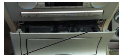
(2)Clips to Remove Ash Tray

INSTALLATION IS NOW COMPLETE. ENJOY YOUR NEW INDASH by PANAVISE MOUNT.