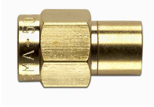
Model 72975 SMA PLUG, 50 OHM TERMINATION

High bandwidth, small size, and durability for confident connections