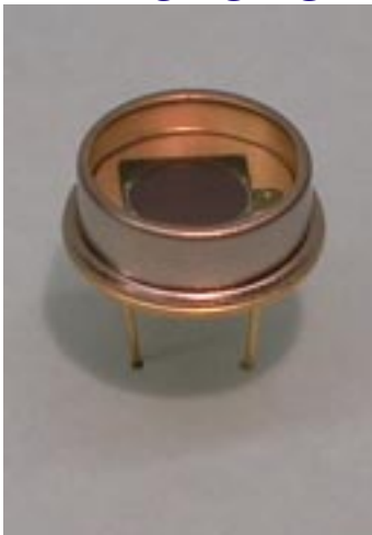
PACKAGE DIMENSIONS INCH [mm]