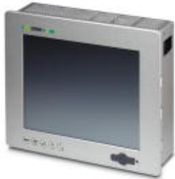
Panel PC with touch screen and software keyboard, 12.1" display, 1 slot, Windows XP German

Please be informed that the data shown in this PDF Document is generated from our Online Catalog. Please find the complete data in the user's documentation. Our General Terms of Use for Downloads are valid ( http://phoenixcontact.com/download )