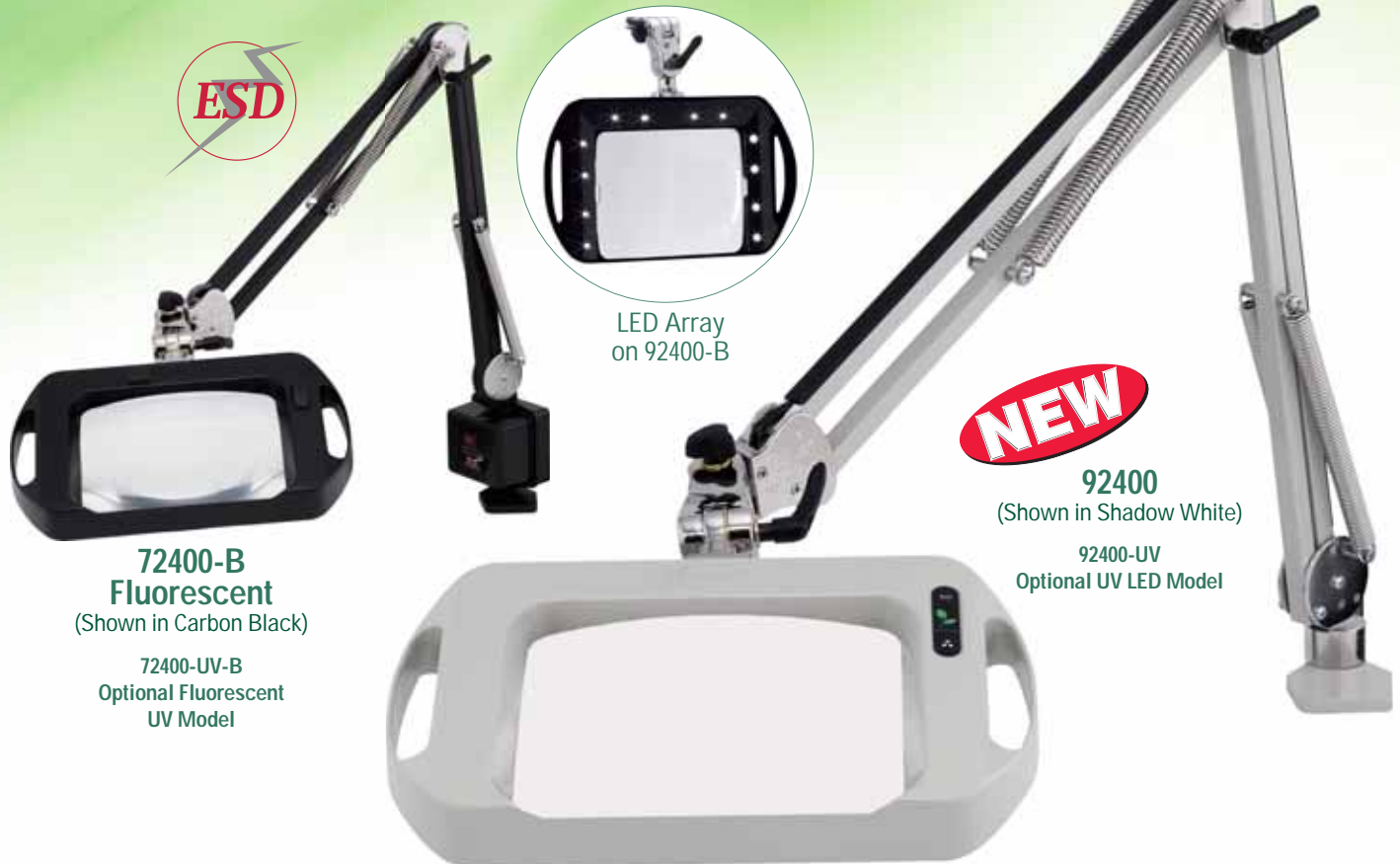
72400-B Fluorescent (Shown in Carbon Black)

The LED Vision-Lite® has all of the other features of our Green-Lite™ models, and is also available in a combination white light/ultraviolet configuration.