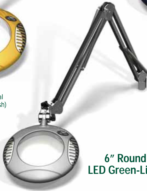
42400-4 (Shown in optional Silver finish)