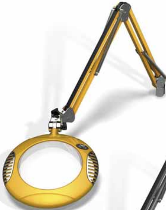
62400-4 (Shown in optional Blazing Yellow finish)