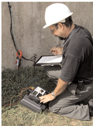
Using ART method with the DET3TC to test commercial ground without disconnecting the system

The DET3TC includes a current measuring function for ART (Attached Rod Technique) testing capabilities. With this added function, on-site grounds can be tested separately without having to remove the utility connection (as explained further in this document).