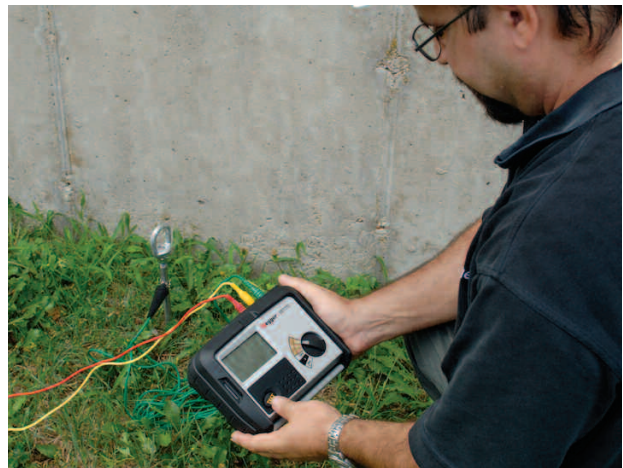
Model DET3TC shown performing the classic fall-of-potential test method.