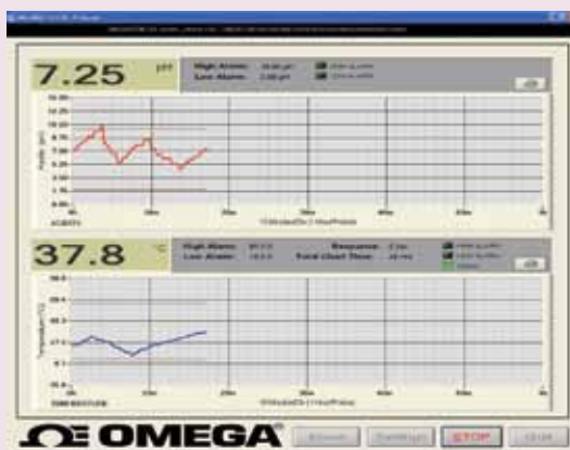
CTXL-PH PC Application