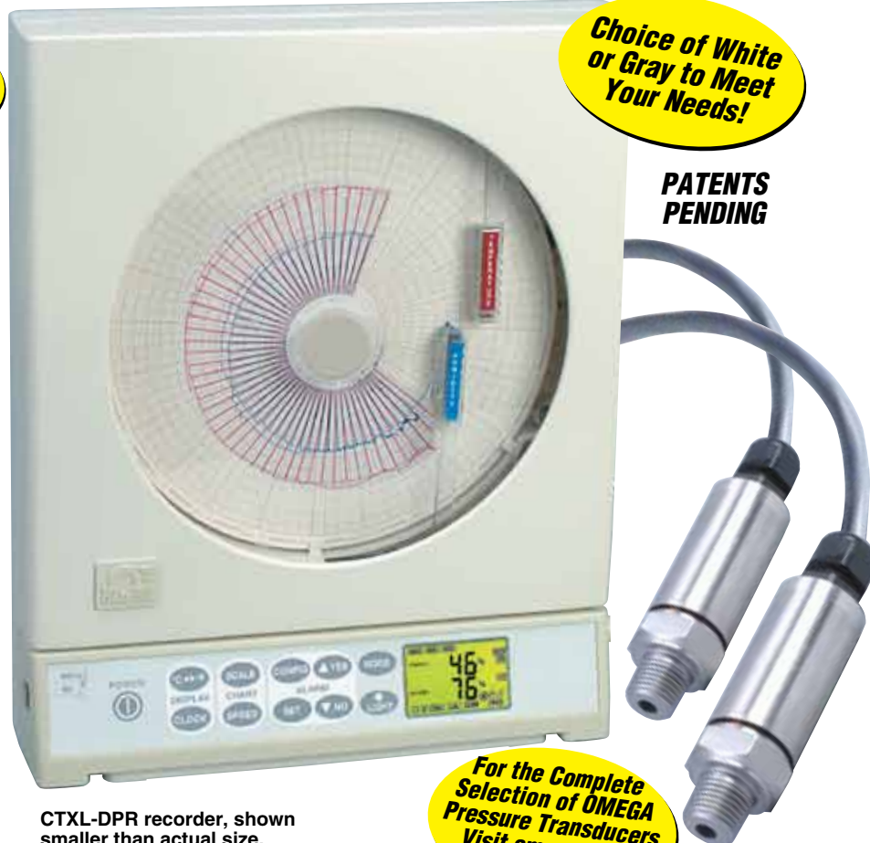
CTXL-DPR recorder, shown smaller than actual size.

For the Complete Selection of OMEGA Pressure Transducers Visit omega.com/px309