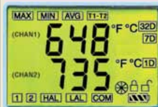
CTXL-DTC–Dual Thermocouple Local Display

Serial PC Communications: RS232, 2-way, 9600 baud