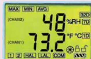
CTXL-TRH–Temperature/Humidity Local Display