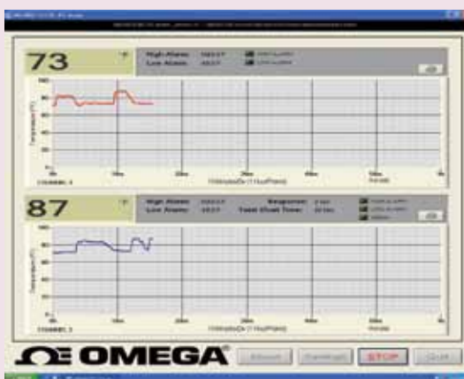
CTXL-DTC PC Application