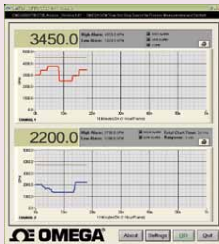
CTXL-DPR PC Application

Battery Status: Indicator on LCD; shows 100, 75%