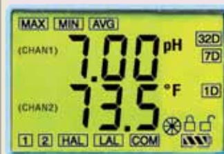
CTXL-PH–pH & RTD Local Display