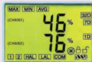
CTXL-DPR–Dual Process Local Display