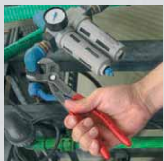
Operation on pneumatic pipes