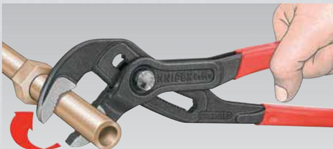
Self-locking on pipes and nuts. No slipping on the workpiece and less handforce required