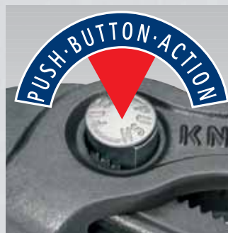
Fine adjustment by pushing a button: fast and comfortable