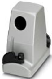
HEAVYCON ADVANCE EMV sleeve housing B10, with bayonet locking, height 100 mm, with 1xM25 thread, lateral cable outlet

Please be informed that the data shown in this PDF Document is generated from our Online Catalog. Please find the complete data in the user's documentation. Our General Terms of Use for Downloads are valid ( http://download.phoenixcontact.com )