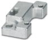
Panel mounting flange for HEAVYCON ADVANCE TMB housing with bayonet locking