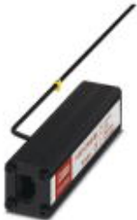
Attachment connector with surge protection for T1/E1 systems. Connection: RJ45 sockets

Please be informed that the data shown in this PDF Document is generated from our Online Catalog. Please find the complete data in the user's documentation. Our General Terms of Use for Downloads are valid ( http://phoenixcontact.com/download )