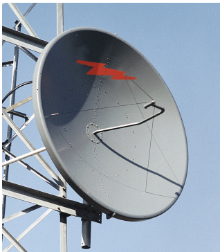
P2-57W-D7A 0.6 m | 2 ft Standard Parabolic Unshielded Antenna, single-polarized, 5.725–6.425 GHz, PDR70, gray antenna, with flash, standard pack—one-piece reflector