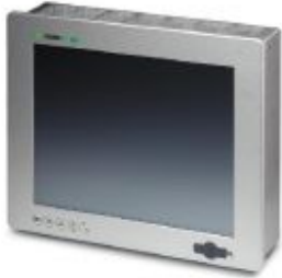
Panel PC with touch screen and software keyboard, 15" display, 1 slot, Windows XP German

Please be informed that the data shown in this PDF Document is generated from our Online Catalog. Please find the complete data in the user's documentation. Our General Terms of Use for Downloads are valid ( http://phoenixcontact.com/download )