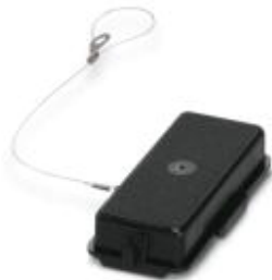
HEAVYCON protective covers, B16, for HC-EVO-B16... supporting base element, for single locking latch, with retaining cord with combination eyelet, IP54

Please be informed that the data shown in this PDF Document is generated from our Online Catalog. Please find the complete data in the user's documentation. Our General Terms of Use for Downloads are valid ( http://phoenixcontact.com/download )