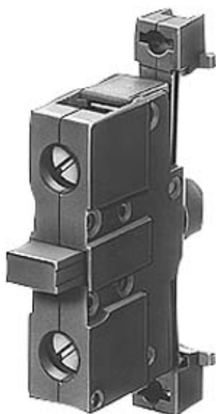
COMPONENT FOR ENCLOSURE, 22MM CONTACT BLOCK WITH 1 CONTACT ELEMENT SCREW TERMINAL, 1NC