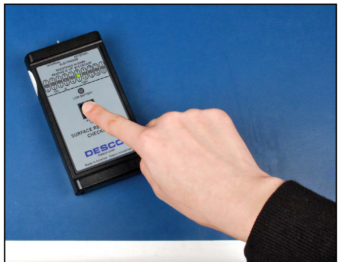
Figure 3. Using the parallel electrodes to measure surface resistance

If the measurement is outside acceptable limits, clean the surface with an ESD cleaner containing no insulative silicone such as Desco 10435 Reztore® Surface & Mat Cleaner, and re-test to determine if the cause of failure is an insulative dirt layer or the ESD worksurface material.