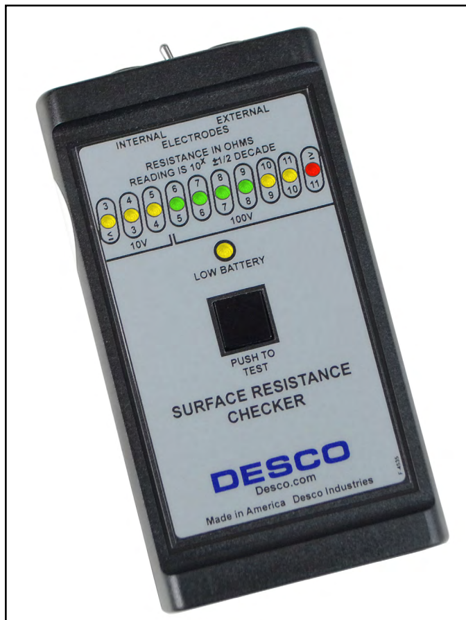
Figure 1. Desco 19640 Surface Resistance Checker