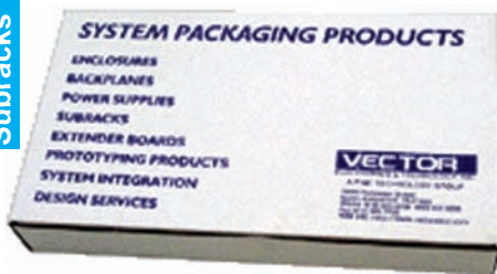
VectorPak™ Kit (CCK)