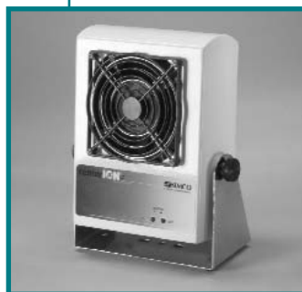
centurION™ Single Fan DC Ionizer