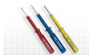
Extraction Tool - R-4601/4602/9461/Kit