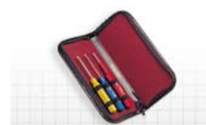
Insertion Tool Kit - KA-260