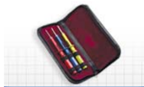
Extraction Tool Kit - KR-260