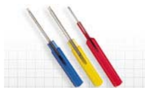
Insertion Tool - A-4598/4599/4600/Kit