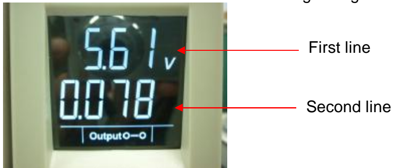
Photo below to show the LCD meter during current calibration mode

Photo below to show the LCD meter during voltage calibration mode