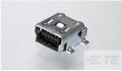
TE Part #1734035-4 MINI USB, TYPE B, R/A, SMT, MYLAR