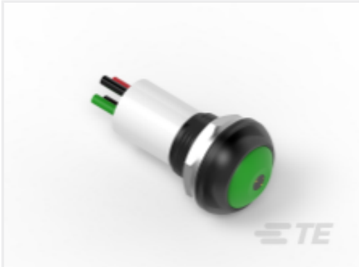
TE Part #1-2329388-8 PB OFF/ON FC GRE M1 TERM YLW LED IP68 50