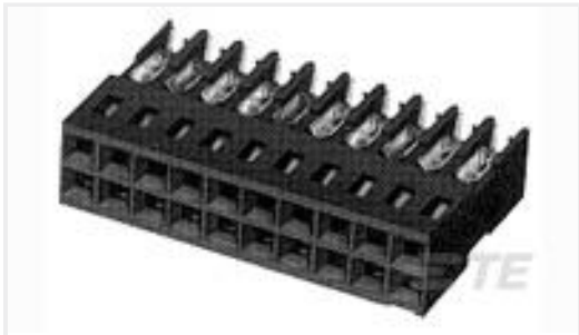
TE Part #1-102694-0 10 AMPMODU MT ASSY DR .100CL