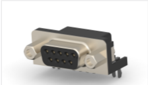
TE Part #2311765-1 AMPL REC, HD20, R/A, 9P, S/L, .318