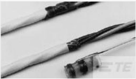
TE Part #470037-000 CWT-9002