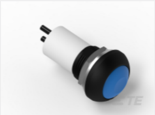
TE Part #2329384-5 PB OFF/ON FC BLU M1 TERM IP68 500MM L