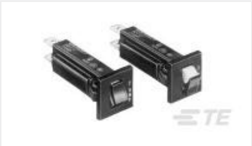
TE Part #3-1393250-7 W28-XQ1A-4=W28-