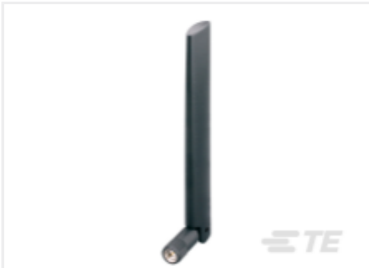
TE Part #ANT-5GWWS1-SMA Antenna Dipole Blade 5G/LTE Swivel SMA