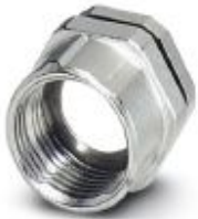
M12 SPEEDCON housing screw connection for M12 female inserts, with O-ring, for all SPEEDCON-capable THR and wave soldering contact carriers

Please be informed that the data shown in this PDF Document is generated from our Online Catalog. Please find the complete data in the user's documentation. Our General Terms of Use for Downloads are valid ( http://phoenixcontact.com/download )