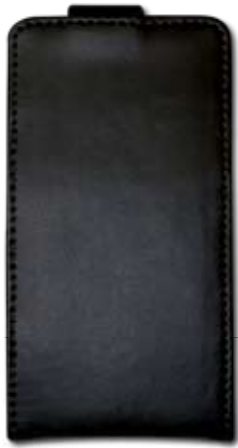
Protective Case / Power Pack