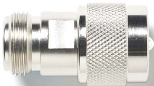
Model 73047 N Type Jack to UHF Plug Adapter