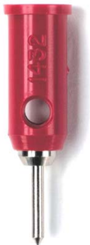
Model 1432 Banana Jack to Pin Tip Plug