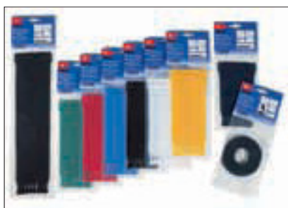
The TEXTIE®-Series is available in different colours and lengths.

GTM-Series Mounts for fixing are available on request. Please contact us!