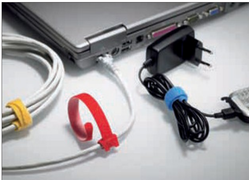
Due to the functional cable tie design the TEXTIE® is fixed on the cable and can't get lost.

There are a lot of private and office applications, too.