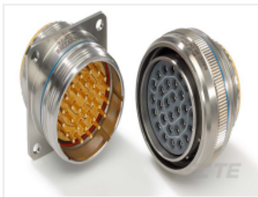
TE Part #ZPF0000000000007174 983-ORS 08-98 PN