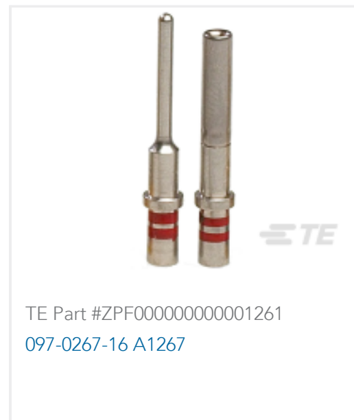
TE Part #ZPF0000000000001261 097-0267-16 A1267