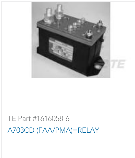
TE Part #1616058-6 A703CD (FAA/PMA)=RELAY