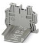
Quick mounting end clamp for NS 35/7,5 DIN rail or NS 35/15 DIN rail, with marking option, with parking option for FBS...5, FBS...6, KSS 5, KSS 6, width: 5.15 mm, color: gray