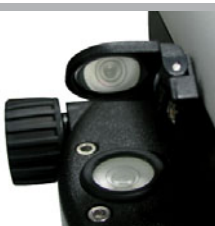
Fold-up mirror for easy alignment