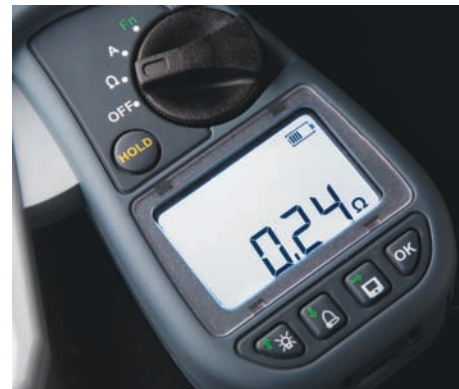
Close up of instrument's front panel.

The clamp head of the DET14C/24C has a smooth mating surface and no interlocking teeth. Its large elliptical design improves access to the test specimen.