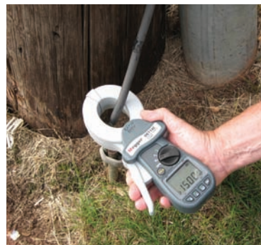
The DET14C is being used to test a pole ground.