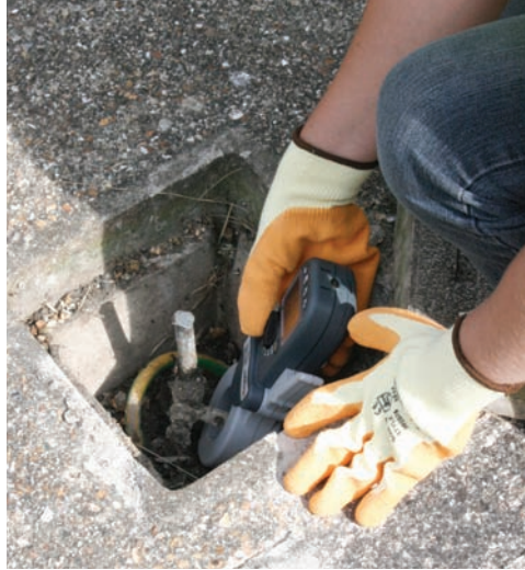
The DET14C is shown measuring a ground spike in a ground well.