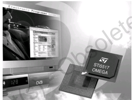
Figure 1. Package: PBGA 35 x 35 (388)