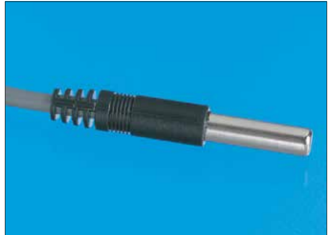
General Purpose Thermistor Sensor

Please contact the factory for specific design or application information or the availability of options.