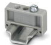
End clamp, width: 6.2 mm, color: gray