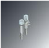
Switching bridge, 2-pos.