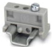
End clamp, width: 6.2 mm, color: gray