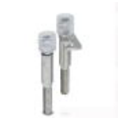
Switching jumper, Color: silver