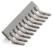
Insertion bridge, Number of positions: 10, Color: gray