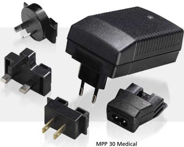
MPP 30 Medical