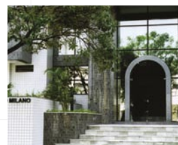
South America, São Paulo