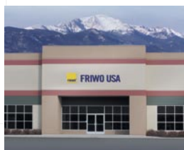
North America, Colorado Springs