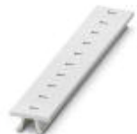
Zack marker strip, Strip, white, labeled, can be labeled with: CMS-P1-PLOTTER, printed horizontally: Identical numbers 1 or 2, etc. up to 100, mounting type: snap into tall marker groove, for terminal block width: 6.2 mm, lettering field size: 6.15 x 10.5 mm, Number of individual labels: 10

Zack marker strip - ZB 6,LGS:GLEICHE ZAHLEN - 1051032