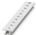
Zack marker strip, Strip, white, labeled, can be labeled with: CMS-P1-PLOTTER, printed horizontally: consecutive numbers 1 ... 10, 11 ... 20, etc. up to 491 ... 500, mounting type: snap into tall marker groove, for terminal block width: 6.2 mm, lettering field size: 6.15 x 10.5 mm, Number of individual labels: 10

Zack marker strip - ZB 6,LGS:FORTL.ZAHLEN - 1051016