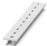
Zack marker strip, Strip, white, labeled, can be labeled with: CMS-P1-PLOTTER, Printed vertically: consecutive numbers 1 ... 10, 11 ... 20, etc. up to 491 ... 500, mounting type: snap into tall marker groove, for terminal block width: 6.2 mm, lettering field size: 6.15 x 10.5 mm, Number of individual labels: 10

Zack marker strip - ZB 6,QR:FORTL.ZAHLEN - 1051029