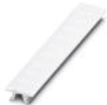
Zack marker strip, can be ordered: Strip, white, labeled according to customer specifications, mounting type: snap into tall marker groove, for terminal block width: 6.2 mm, lettering field size: 6.15 x 10.5 mm, Number of individual labels: 10

Zack marker strip - ZB 6,LGS:FORTL.ZAHLEN - 1051016