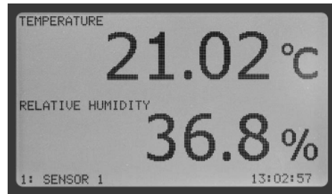
Temperature and humidity display

The 5020A calculates dew point, heat index, and rates of change for temperature and humidity. Min, max, and a variety of other statistics are calculated and can be shown in more than 16 different user configurable display formats and more than 12 display parameters. Daily summary statistics, including min, max, and maximum rates of change are stored for the most recent 60 days.