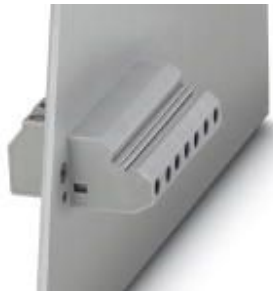
The figure shows a 7-position version

Please be informed that the data shown in this PDF Document is generated from our Online Catalog. Please find the complete data in the user's documentation. Our General Terms of Use for Downloads are valid ( http://phoenixcontact.com/download )