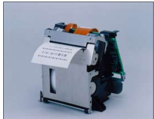
FTP-627USL401 platen/cutter closed