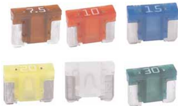
Dimensions - mm (in)