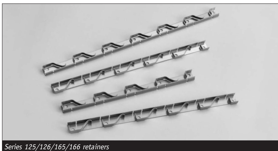
Series 125/126/165/166 retainers