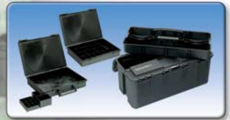
▲ A wide range of mobile ESD products. All stationary products are equipped with earth leads