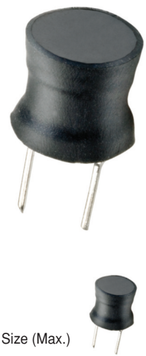
Actual Size (Max.)