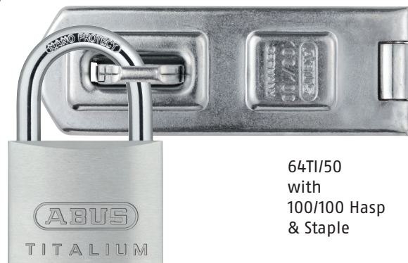
64TI/50 with 100/100 Hasp & Staple

Ideal for medium to high risk of theft, the 64TI series TITALIUM™ padlocks is recommended for a wide range of security requirements. All models in this series have a paracentric keyway, chrome plated cylinder cores and through hardened steel shackle. NANO Protect shackle coating assures security & high corrosion resistance.