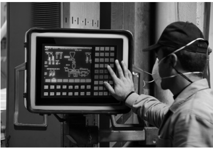
▲ Ideal for factory automation & self-service kiosk in retail