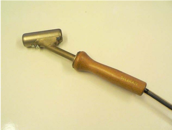
Iron featured without bit