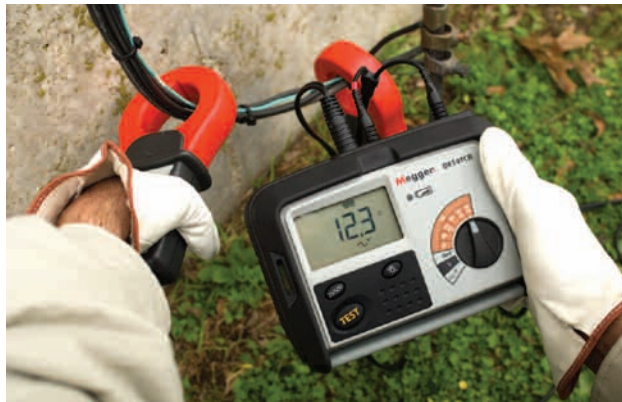
Model DET4TCR shown performing the stakeless ground testing method using only clamps.

connection and conditions of the P spike, C spike, and also the level of ground noise, indicating the status on the display. (The analog model allows the operator to check the condition of the spikes). The instruments also include a voltmeter to enable measurement of ground voltage. Four of the models (the DET3TD, 3TA, 3TC and 4TD) can measure resistance from 0.01 ohms to 2 kΩ, while the DET4TC and 4TCR can measure resistance from 0.01 ohms to 20 kΩ. Also, to allow accurate testing in noisy environments, the instruments are capable of rejecting noise up to 40V peak to peak.