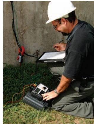
Using ART method with the DET3TC to test commercial ground without disconnecting the system

With this added function, on-site grounds can be tested separately without having to remove the utility connection (as explained further in this document). The new DET4TC and 4TCR also provides a stakeless testing technique. It allows the operator to use the instrument