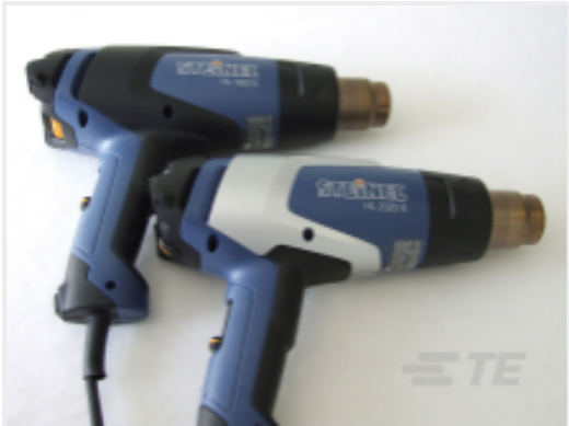
TE Part # EG8162-000 HL1920E-230V-EURO

This information is provided based on reasonable inquiry of our suppliers and represents our current actual knowledge based on the information they provided. This information is subject to change. The part numbers that TE has identified as EU RoHS compliant have a maximum concentration of 0.1% by weight in homogenous materials for lead, hexavalent chromium, mercury, PBB, PBDE, DBP, BBP, DEHP, DIBP, and 0.01% for cadmium, or qualify for an exemption to these limits as defined in the Annexes of Directive 2011/65/EU (RoHS2). Finished electrical and electronic equipment products will be CE marked as required by Directive 2011/65/EU. Components may not be CE marked. Additionally, the part numbers that TE has identified as EU ELV compliant have a maximum concentration of 0.1% by weight in homogenous materials for lead, hexavalent chromium, and mercury, and 0.01% for cadmium, or qualify for an exemption to these limits as defined in the Annexes of Directive 2000/53/EC (ELV). Regarding the REACH Regulation, the information TE provides on SVHC in articles for this part number is based on the latest European Chemicals Agency (ECHA) ‘Guidance on requirements for substances in articles’ posted at this URL: https://echa.europa.eu/guidance-documents/guidance-on-reach