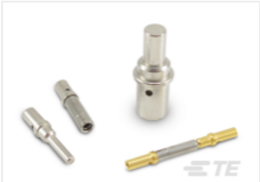
TE Part #CAT-D48-ST273 DEUTSCH Connector Solid Contacts