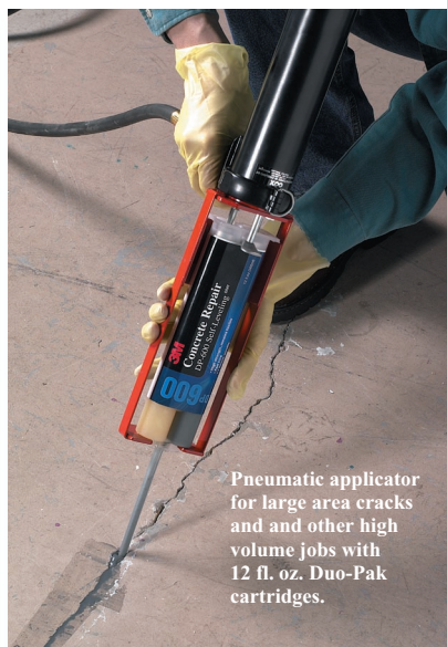
Pneumatic applicator for large area cracks and other high volume jobs with 12 fl. oz. Duo-Pak cartridges.