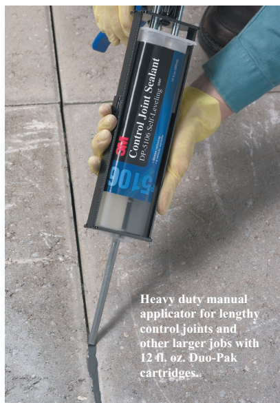
Heavy duty manual applicator for lengthy control joints and other larger jobs with 12 fl. oz. Duo-Pak cartridges.