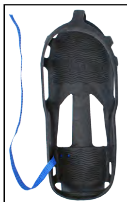
04590 Top View

"If the contact area between the bottom of the foot and the floor is not continuous, charge generation may occur; especially when a person is walking. Heel straps must be worn on both feet to minimize the amount of time that the body of the person is isolated from ground while walking." [ESD Handbook ESD TR20.20 section 5.2.3 Flooring-Footwear System]